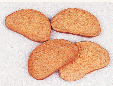
15490 4 Fette pain de seigle