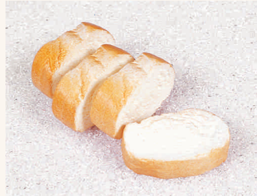
15488 4 Fette filone