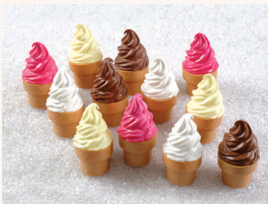
11359 12 Coppe gelato