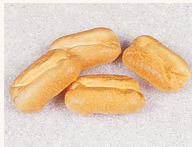
15497 4 Pani