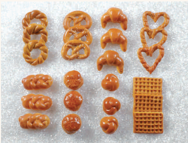
15501 24 Mini pani assortiti