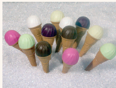
11360 12 Coni gelato