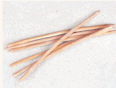
15484 6 Grissini