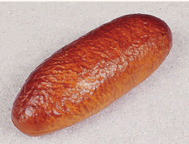
15499 Pain ovale tedesco