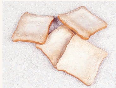
15489 4 Fette pancarrè