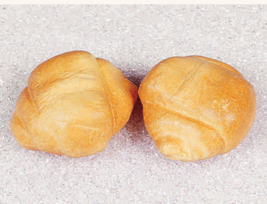
15495 2 Pagnotte