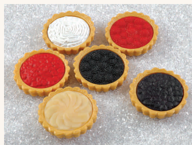
14465 6 Tortine assortite