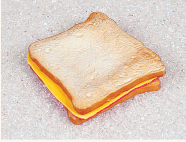
15532 Ham cheese toast