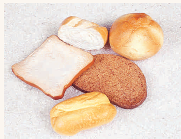
17583 5 Pani assortiti