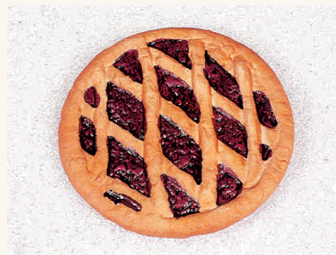
14473 Crostatà marmellata