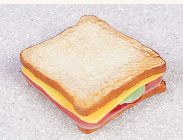
15530 Bacon tomato sandwich