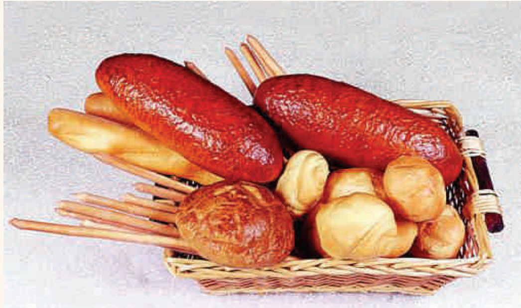
17613 Cestino pane