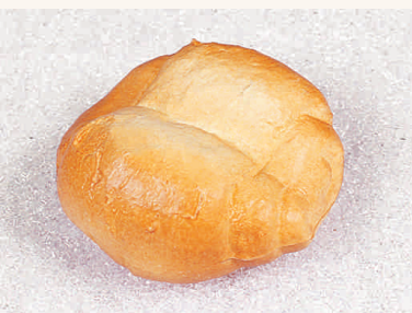
15498 Pane grande