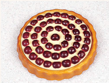
14457 Torta ciliegie