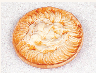
14474 Crostatà mele