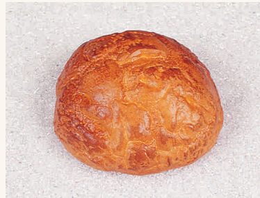
15500 Pain tondo tedesco