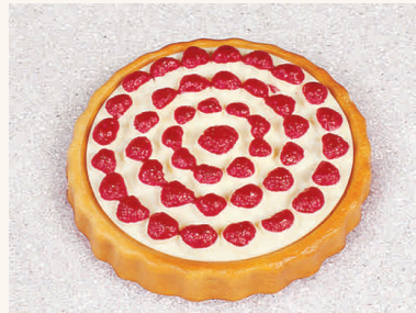
14458 Torta fragole