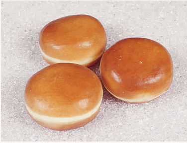
15486 3 Krapfen