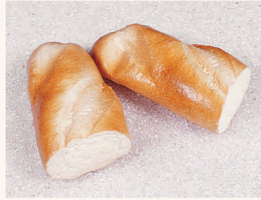
15493 2 Mezzi filoni