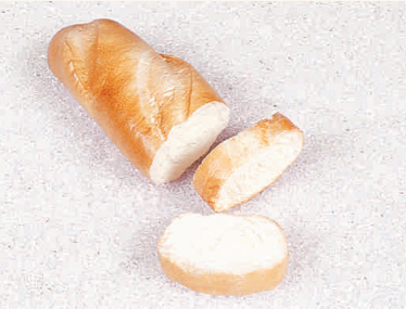
15494 Mezzo filone con 2 fette