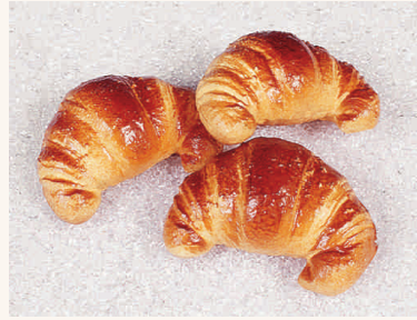
15487 3 Croissants