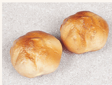
15503 2 Rosette