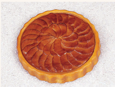
14460 Torta mele