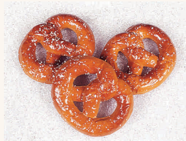
15482 3 Bretzel piccoli