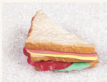
15531 Sandwich club 1/4