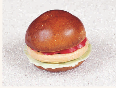
15533 Hamburger sandwich